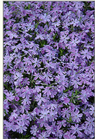
Emerald Blue Creeping Phlox flowers