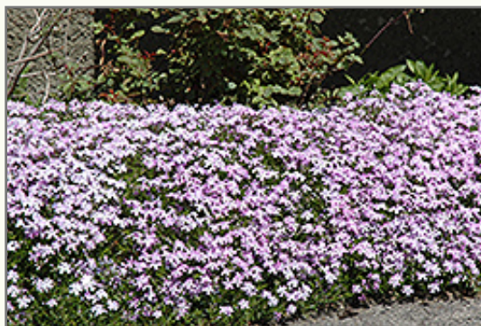
Emerald Blue Creeping Phlox in bloom