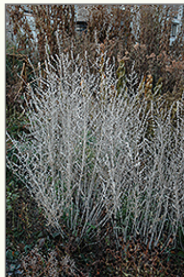
Russian Sage in winter