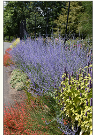
Russian Sage in bloom