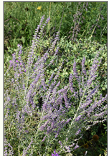
Russian Sage flowers