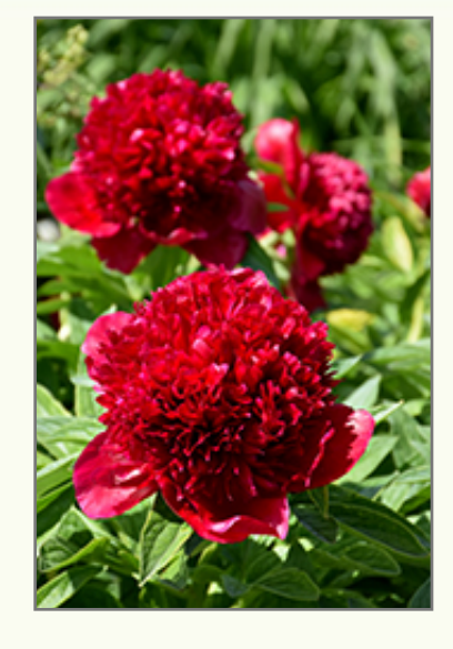
Red Charm Peony flowers