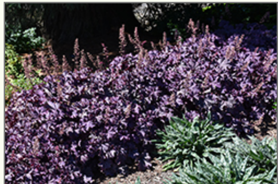
Grande Amethyst Coral Bells in bloom