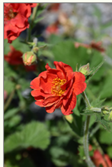
Double Bloody Mary Avens flowers