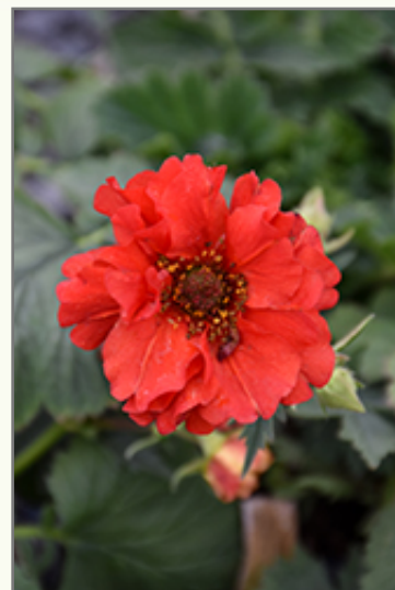
Double Bloody Mary Avens flowers

Double Bloody Mary Avens is recommended for the following landscape applications;