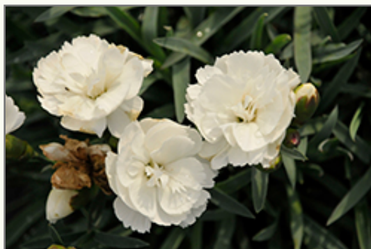
Constant Beauty White Pinks flowers

Constant Beauty White Pinks is recommended for the following landscape applications;