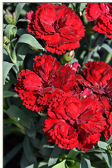
Constant Beauty Red Pinks flowers

Constant Beauty Red Pinks is recommended for the following landscape applications;