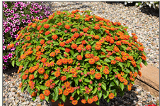
Hot Blooded Red Lantana in bloom