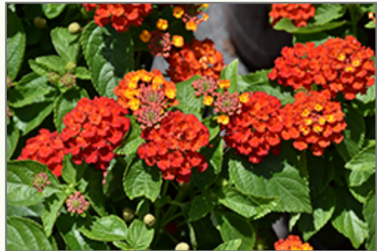
Hot Blooded Red Lantana flowers

Hot Blooded Red Lantana is a multi-stemmed annual with a mounded form. Its medium texture blends into the garden, but can always be balanced by a couple of finer or coarser plants for an effective composition.