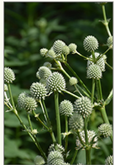
Rattlesnake Master flowers

Rattlesnake Master is an herbaceous perennial with a mounded form. Its relatively fine texture sets it apart from other garden plants with less refined foliage.