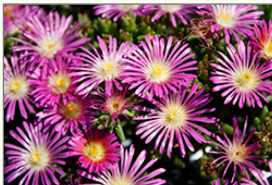
Delmara Pink Ice Plant flowers

Delmara Pink Ice Plant is recommended for the following landscape applications;