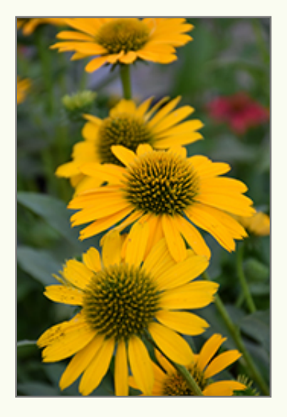
Kismet Yellow Coneflower flowers