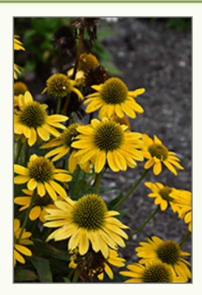
Kismet Yellow Coneflower flowers

Kismet Yellow Coneflower is recommended for the following landscape applications;