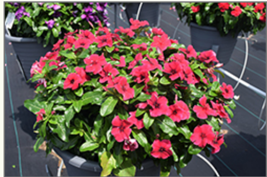
Tattoo Black Cherry Vinca in bloom