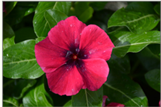
Tattoo Black Cherry Vinca flowers

Tattoo Black Cherry Vinca is a dense herbaceous annual with a mounded form. Its medium texture blends into the garden, but can always be balanced by a couple of finer or coarser plants for an effective composition.