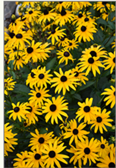
American Gold Rush Black Eyed Susan flowers

American Gold Rush Black Eyed Susan is an herbaceous perennial with an upright spreading habit of growth. Its medium texture blends into the garden, but can always be balanced by a couple of finer or coarser plants for an effective composition.