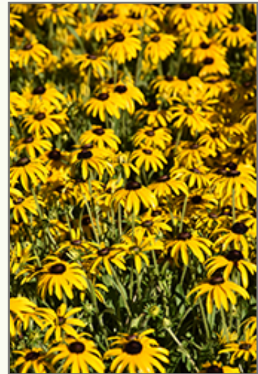
American Gold Rush Black Eyed Susan flowers

American Gold Rush Black Eyed Susan is a fine choice for the garden, but it is also a good selection for planting in outdoor pots and containers. With its upright habit of growth, it is best suited for use as a 'thriller' in the 'spiller-thriller-filler' container combination; plant it near the center of the pot, surrounded by smaller plants and those that spill over the edges. Note that when growing plants in outdoor containers and baskets, they may require more frequent waterings than they would in the yard or garden. Be aware that in our climate, most plants cannot be expected to survive the winter if left in containers outdoors, and this plant is no exception. Contact our experts for more information on how to protect it over the winter months.