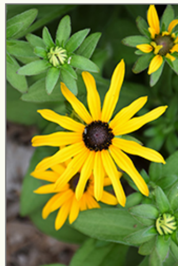
Deamii Black Eyed Susan flowers

Deamii Black Eyed Susan is a fine choice for the garden, but it is also a good selection for planting in outdoor pots and containers. With its upright habit of growth, it is best suited for use as a 'thriller' in the 'spiller-thriller-filler' container combination; plant it near the center of the pot, surrounded by smaller plants and those that spill over the edges. It is even sizeable enough that it can be grown alone in a suitable container. Note that when growing plants in outdoor containers and baskets, they may require more frequent waterings than they would in the yard or garden. Be aware that in our climate, most plants cannot be expected to survive the winter if left in containers outdoors, and this plant is no exception. Contact our experts for more information on how to protect it over the winter months.