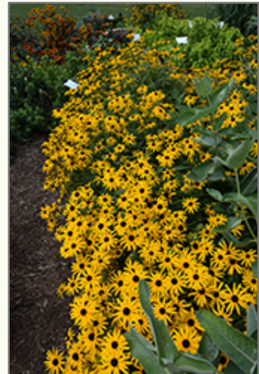
Deamii Black Eyed Susan in bloom