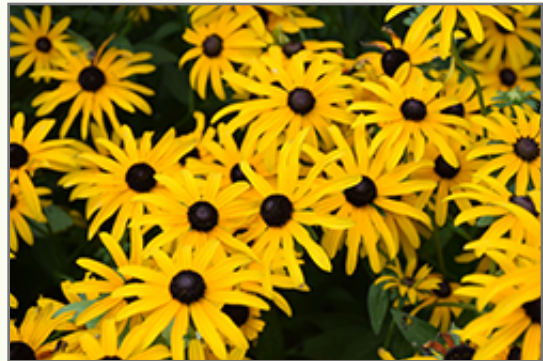
Deamii Black Eyed Susan flowers

Deamii Black Eyed Susan is an herbaceous perennial with an upright spreading habit of growth. Its medium texture blends into the garden, but can always be balanced by a couple of finer or coarser plants for an effective composition.