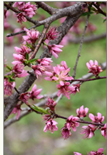
Contender Peach flowers