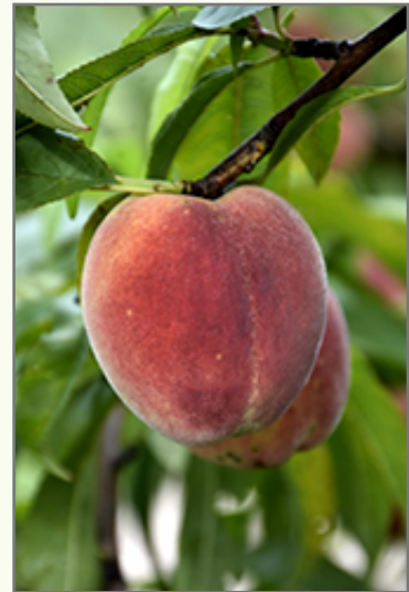
Contender Peach fruit