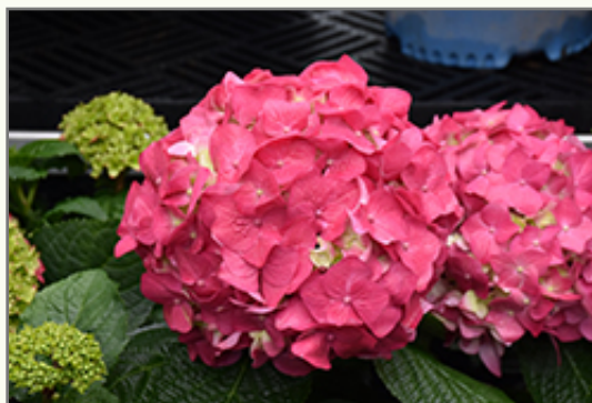
Endless Summer® Summer Crush® Hydrangea flowers

Endless Summer® Summer Crush® Hydrangea is recommended for the following landscape applications;