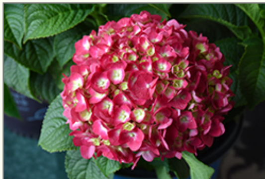
Endless Summer® Summer Crush® Hydrangea flowers