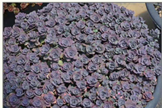
SunSparkler® Blue Elf Sedum