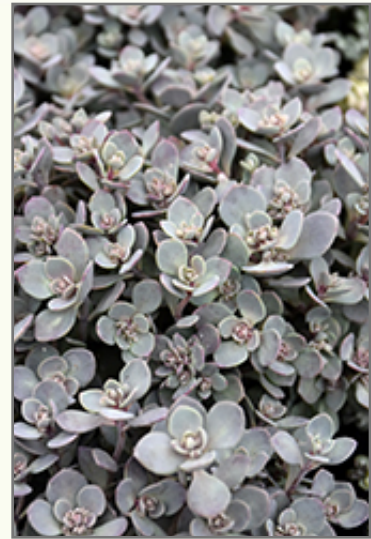
SunSparkler® Blue Elf Sedum foliage