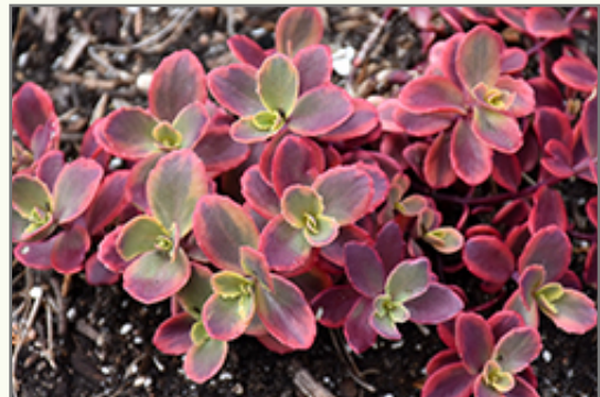
SunSparkler® Wildfire Sedum foliage