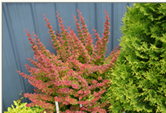
Sunjoy® Tangelo Barberry