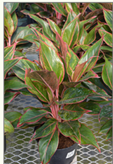
Siam Aurora Chinese Evergreen in full