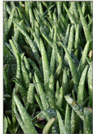
Aloe Vera

This is an herbaceous evergreen houseplant with an upright spreading habit of growth. Its wonderfully bold, coarse texture is quite ornamental and should be used to full effect. This plant usually looks its best without pruning, although it will tolerate pruning.