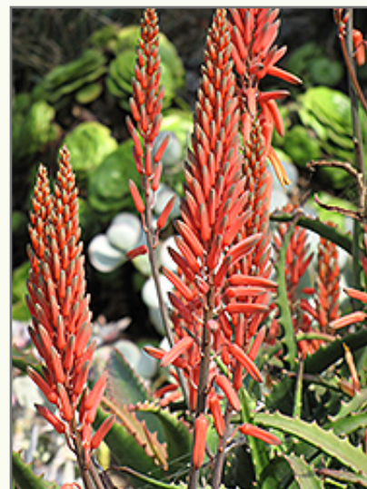
Aloe Vera flowers

When grown indoors, Aloe Vera can be expected to grow to be about 24 inches tall at maturity extending to 3 feet tall with the flowers, with a spread of 24 inches. It grows at a slow rate, and under ideal conditions can be expected to live for approximately 40 years. This houseplant requires direct sun for optimal performance, and should therefore be situated in a room that gets bright sunlight for a good part of the day; it is not a good choice for rooms lit only by artificial light. It prefers dry to average moisture levels with very well-drained soil, and may die if left in standing water for any length of time. This plant should be watered when the surface of the soil gets dry, and will need watering approximately once each week. Be aware that your particular watering schedule may vary depending on its location in the room, the pot size, plant size and other conditions; if in doubt, ask one of our experts in the store for advice. It is not particular as to soil pH, but grows best in sandy soil. Contact the store for specific recommendations on pre-mixed potting soil for this plant.