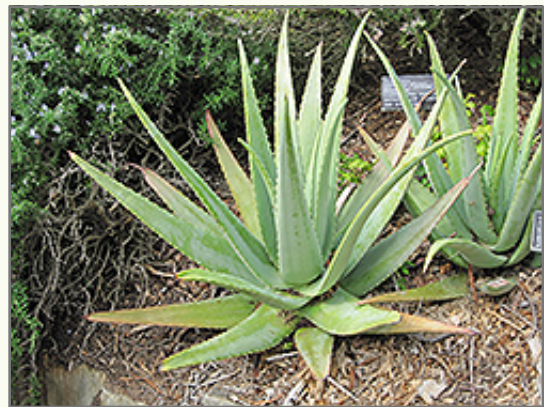
Aloe Vera