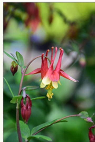
Columbine flowers