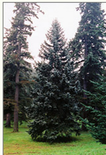
Thomsen Colorado Blue Spruce