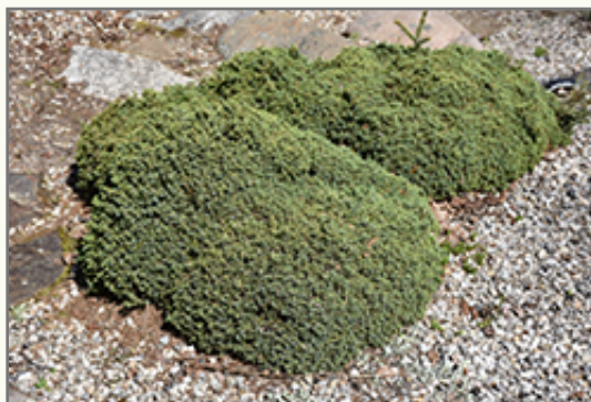
Blue Nest Spruce

Blue Nest Spruce is recommended for the following landscape applications;