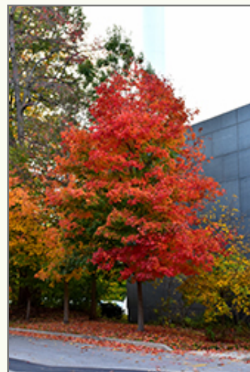
Fall Fiesta® Sugar Maple in fall

Fall Fiesta® Sugar Maple is recommended for the following landscape applications;