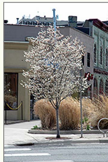
Autumn Brilliance® Serviceberry in bloom

This tree will require occasional maintenance and upkeep, and is best pruned in late winter once the threat of extreme cold has passed. It is a good choice for attracting birds to your yard, but is not particularly attractive to deer who tend to leave it alone in favor of tastier treats. It has no significant negative characteristics.