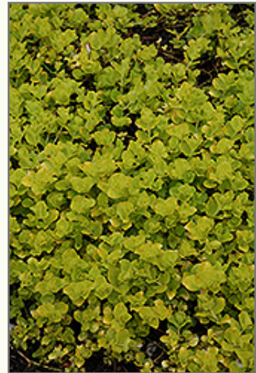
Golden Lysimachia foliage

Golden Lysimachia is recommended for the following landscape applications;