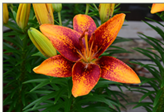
Tiny® Orange Sensation Asiatic Lily flowers