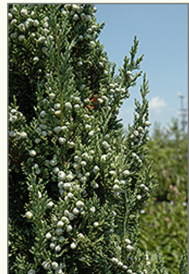
Trautman Juniper fruit