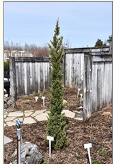
Trautman Juniper