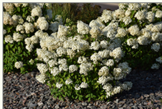
Bobo® Hydrangea in bloom