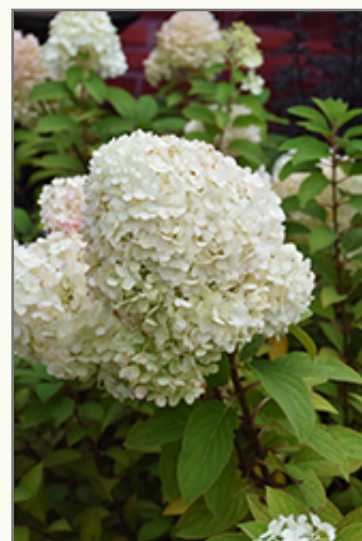
Bobo® Hydrangea flowers