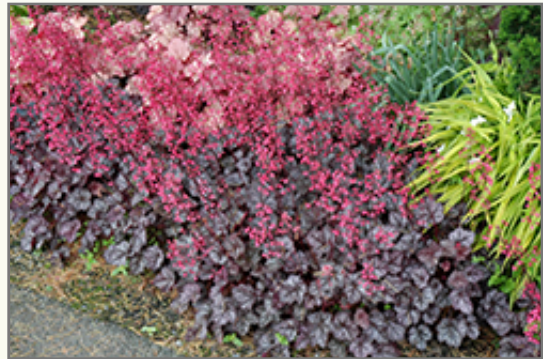
Glitter Coral Bells in bloom

Glitter Coral Bells is a dense herbaceous evergreen perennial with tall flower stalks held atop a low mound of foliage. Its relatively fine texture sets it apart from other garden plants with less refined foliage.