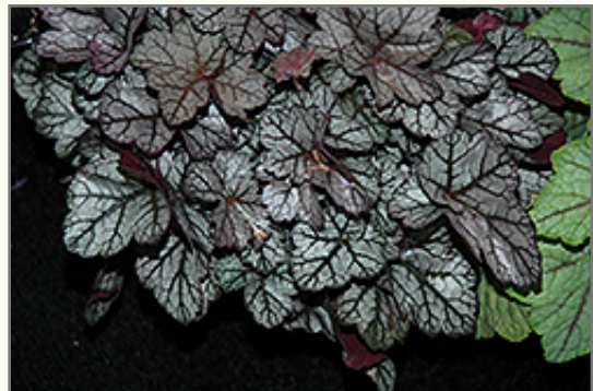
Glitter Coral Bells foliage