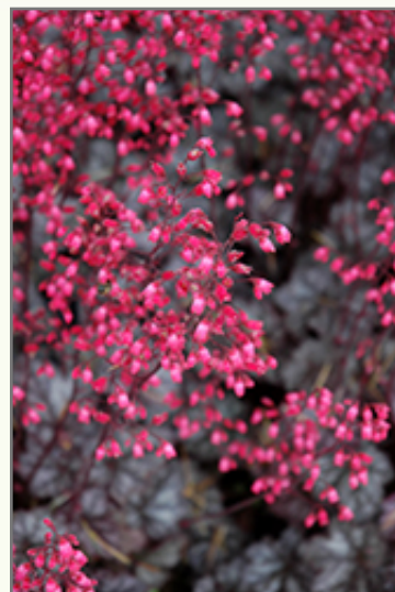
Glitter Coral Bells flowers