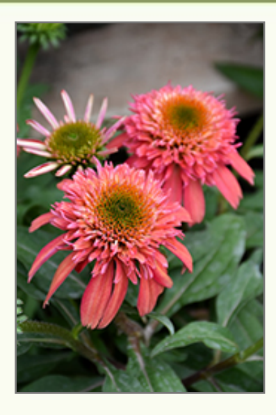
Double Scoop Cranberry Coneflower flowers

Double Scoop Cranberry Coneflower is recommended for the following landscape applications;