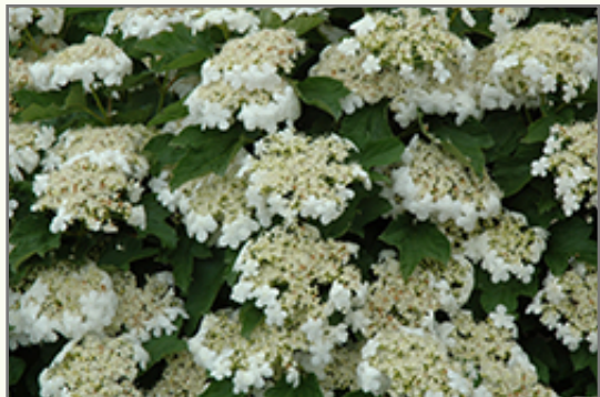
Compact European Cranberrybush flowers