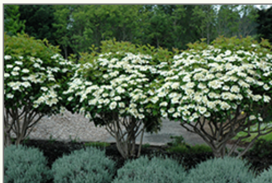
Compact European Cranberrybush in bloom

Compact European Cranberrybush is a dense multi-stemmed deciduous shrub with a more or less rounded form. Its average texture blends into the landscape, but can be balanced by one or two finer or coarser trees or shrubs for an effective composition.