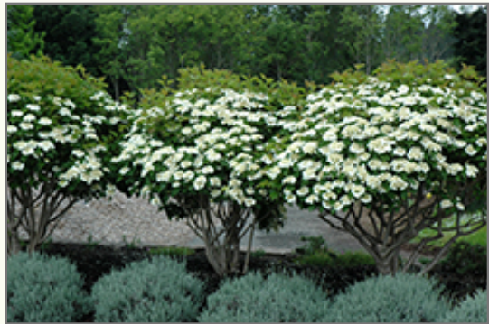
Compact European Cranberrybush in bloom

Compact European Cranberrybush is a dense multi-stemmed deciduous shrub with a more or less rounded form. Its average texture blends into the landscape, but can be balanced by one or two finer or coarser trees or shrubs for an effective composition.