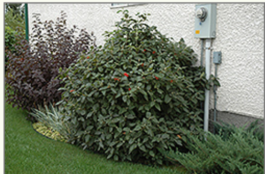
Mohican Viburnum