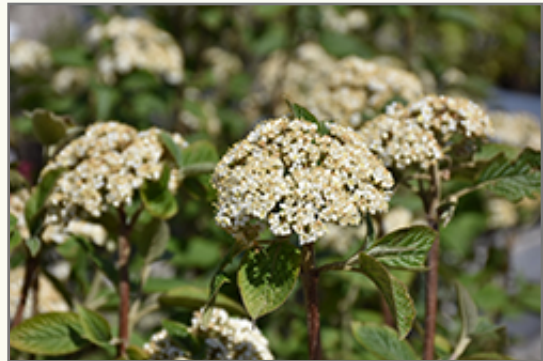
Mohican Viburnum flowers

Mohican Viburnum is a multi-stemmed deciduous shrub with a more or less rounded form. Its average texture blends into the landscape, but can be balanced by one or two finer or coarser trees or shrubs for an effective composition.