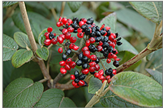
Mohican Viburnum fruit