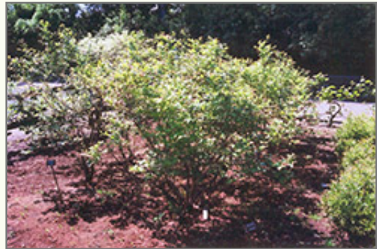
Northland Blueberry