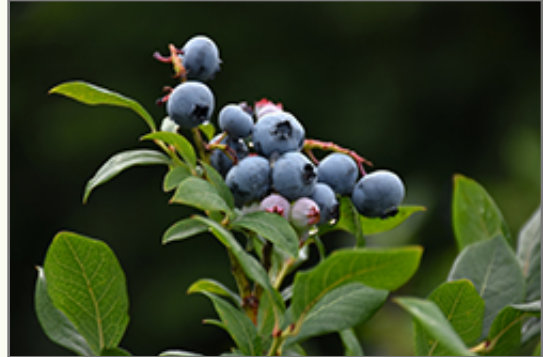
Northland Blueberry fruit