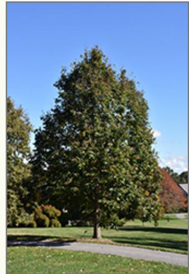
Redmond Linden

This is a high maintenance tree that will require regular care and upkeep, and is best pruned in late winter once the threat of extreme cold has passed. It is a good choice for attracting bees to your yard. Gardeners should be aware of the following characteristic(s) that may warrant special consideration;