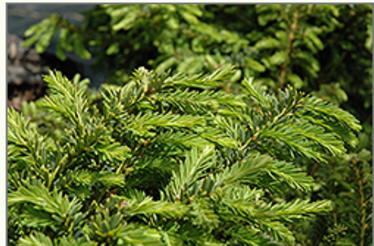
Emerald Spreader® Japanese Yew foliage