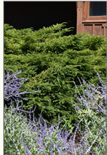
Emerald Spreader® Japanese Yew

Emerald Spreader® Japanese Yew is recommended for the following landscape applications;