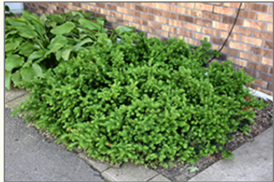
Emerald Spreader® Japanese Yew