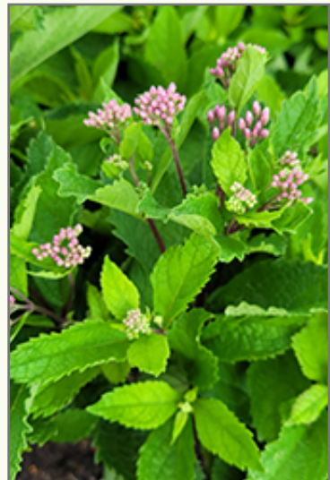
Phantom Joe Pye Weed flower buds