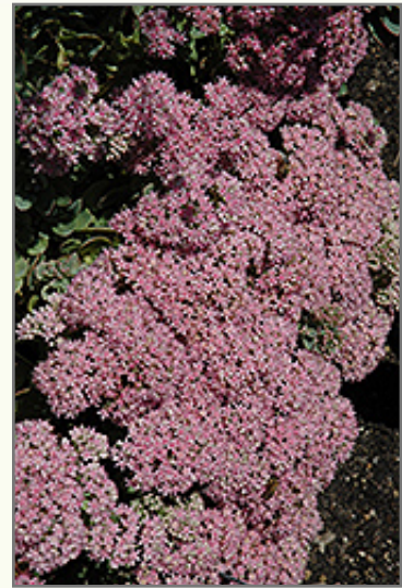
SunSparkler® Lime Zinger Sedum flowers

SunSparkler® Lime Zinger Sedum is a dense herbaceous perennial with a ground-hugging habit of growth. Its medium texture blends into the garden, but can always be balanced by a couple of finer or coarser plants for an effective composition.