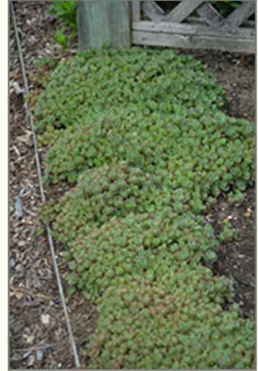
SunSparkler® Lime Zinger Sedum

SunSparkler® Lime Zinger Sedum is a fine choice for the garden, but it is also a good selection for planting in outdoor pots and containers. Because of its spreading habit of growth, it is ideally suited for use as a 'spiller' in the 'spiller-thriller-filler' container combination; plant it near the edges where it can spill gracefully over the pot. Note that when growing plants in outdoor containers and baskets, they may require more frequent waterings than they would in the yard or garden. Be aware that in our climate, most plants cannot be expected to survive the winter if left in containers outdoors, and this plant is no exception. Contact our experts for more information on how to protect it over the winter months.