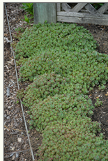
SunSparkler® Lime Zinger Sedum

SunSparkler® Lime Zinger Sedum is a fine choice for the garden, but it is also a good selection for planting in outdoor pots and containers. Because of its spreading habit of growth, it is ideally suited for use as a 'spiller' in the 'spiller-thriller-filler' container combination; plant it near the edges where it can spill gracefully over the pot. Note that when growing plants in outdoor containers and baskets, they may require more frequent waterings than they would in the yard or garden. Be aware that in our climate, most plants cannot be expected to survive the winter if left in containers outdoors, and this plant is no exception. Contact our experts for more information on how to protect it over the winter months.