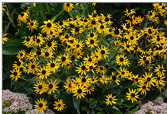
Little Goldstar Black Eyed Susan in bloom

Little Goldstar Black Eyed Susan is an herbaceous perennial with an upright spreading habit of growth. Its medium texture blends into the garden, but can always be balanced by a couple of finer or coarser plants for an effective composition.