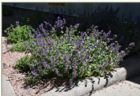
Little Trudy® Catmint in bloom