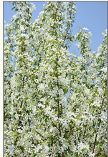
Starlite® Flowering Crabapple flowers

Starlite® Flowering Crabapple is recommended for the following landscape applications;