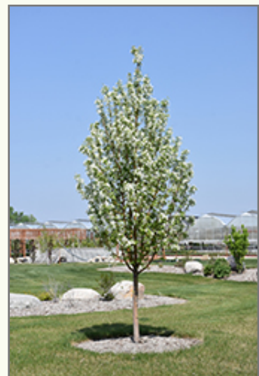
Starlite® Flowering Crabapple in bloom