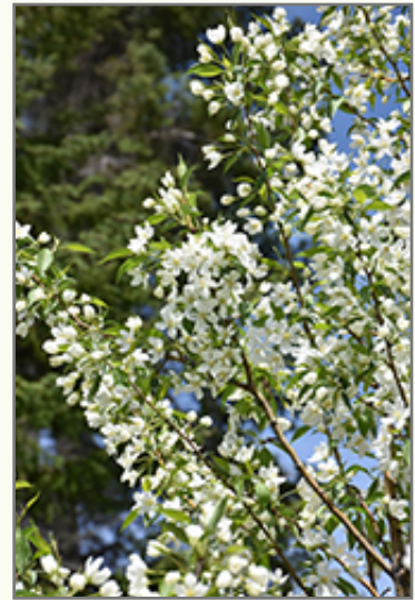
Starlite® Flowering Crabapple flowers