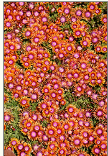
Fire Spinner Ice Plant flowers