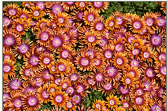
Fire Spinner Ice Plant in bloom

Fire Spinner Ice Plant is recommended for the following landscape applications;