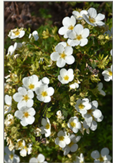
McKay's White Potentilla flowers

McKay's White Potentilla is recommended for the following landscape applications;