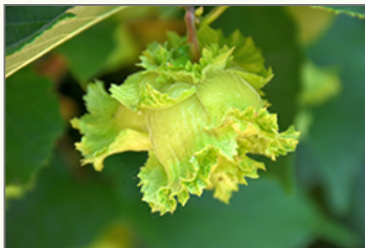
American Hazelnut fruit