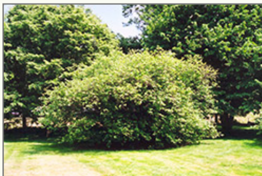
American Hazelnut