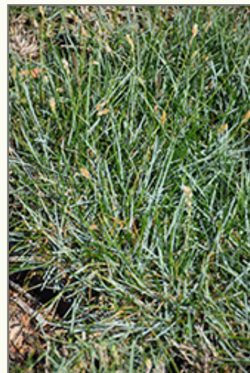
Blue Moor Grass foliage