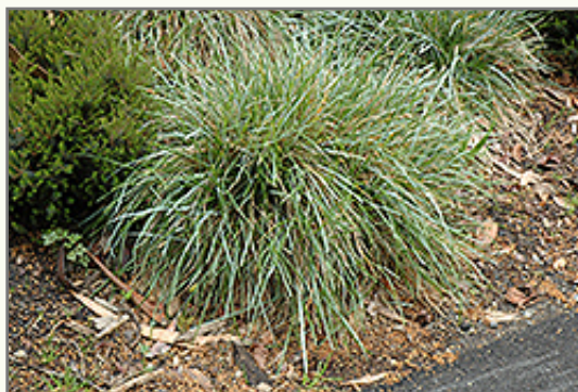
Blue Moor Grass