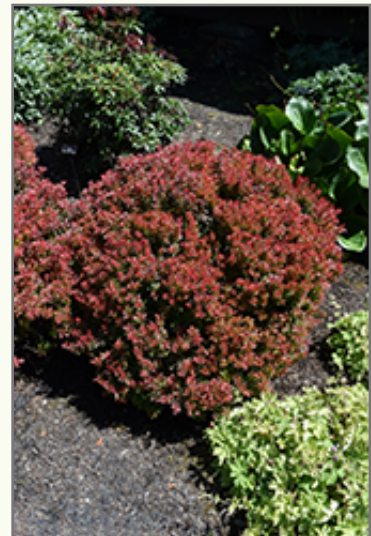
Golden Ruby® Barberry