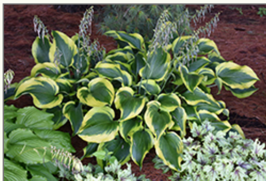
Atlantis Hosta