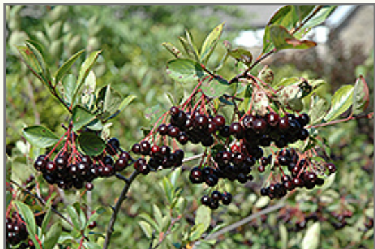
Autumn Magic Black Chokeberry fruit

Autumn Magic Black Chokeberry will grow to be about 5 feet tall at maturity, with a spread of 4 feet. It tends to be a little leggy, with a typical clearance of 1 foot from the ground, and is suitable for planting under power lines. It grows at a slow rate, and under ideal conditions can be expected to live for approximately 20 years.