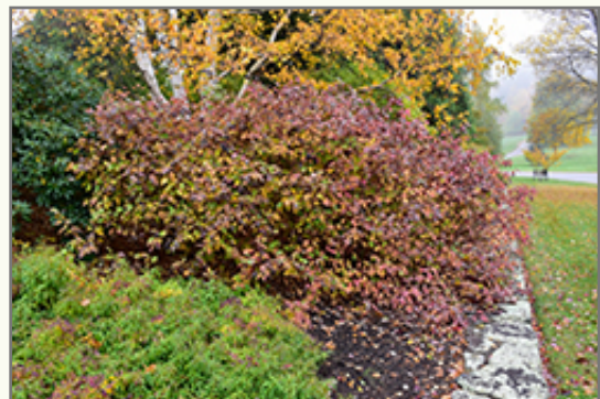
Red Twigged Dogwood in fall